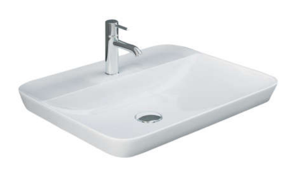
Faucet not included